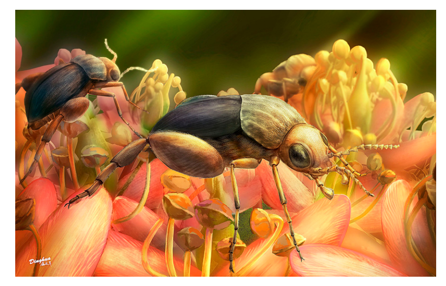
Fig. 3. Ecological reconstruction of A. burmitina . These tumbling flower beetles are feeding on eudicot flowers. The color and morphology of flowers are artistic only.

pronotum. Antennae comparatively short, with 7 visible antennomeres, obviously serrate (Fig. 1D), covered with hairs. Maxillary palp length 0.38 mm; apical maxillary palpomere length 0.18 mm, securiform, strongly enlarged.